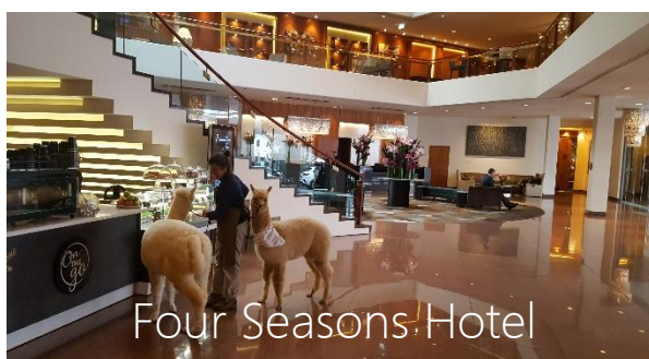
Four Seasons Hotel