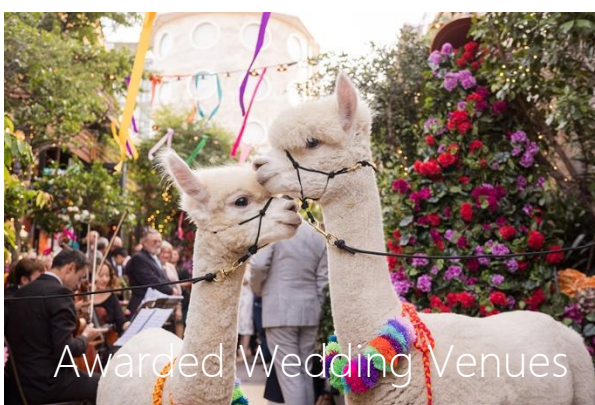
Awarded Wedding Venues