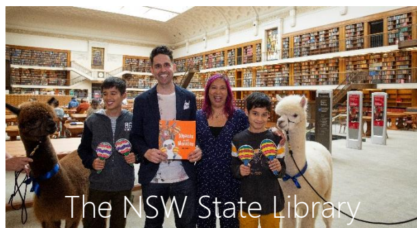
The NSW State Library